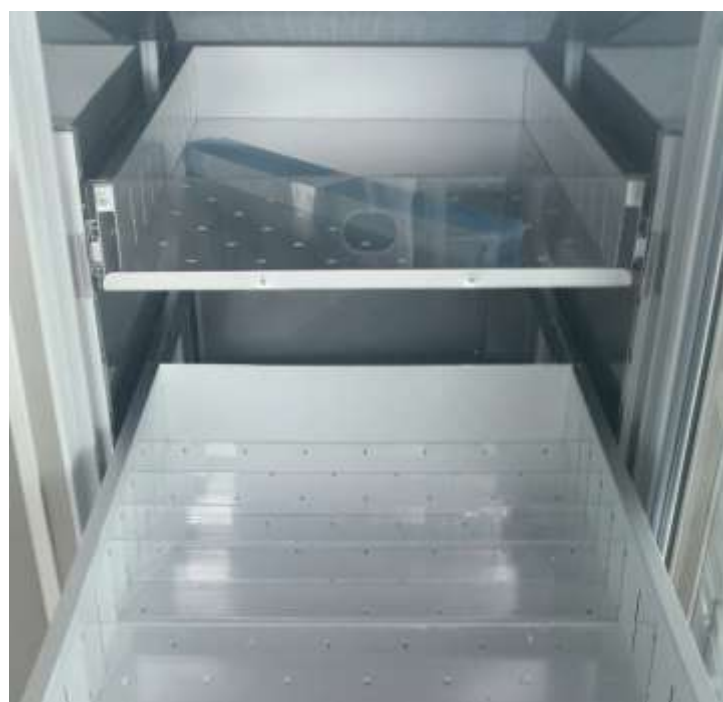
SLIDING S/S AISI 304 SCOTCH BRITE PERFORATED SHELVES ON BALL BEARINGS