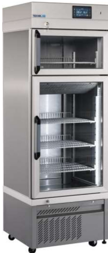
Model MT 4102CB – 110+220lts