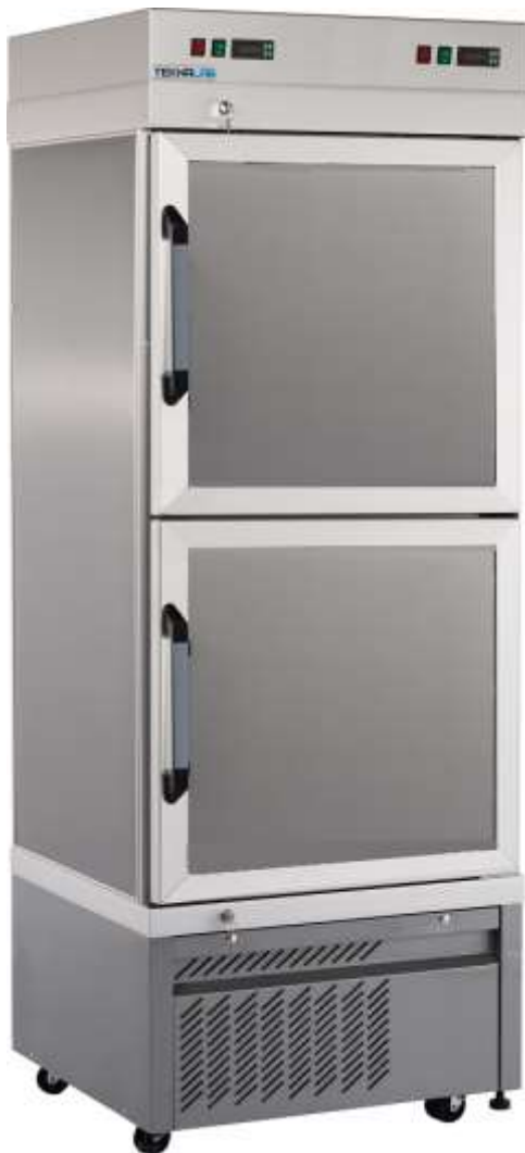
Model MT 4000CB – 165+165lts

BACK-UP BATTERY Autonomy 48hrs – DRY CONTACT BMS CONNECTION (NO,NC)